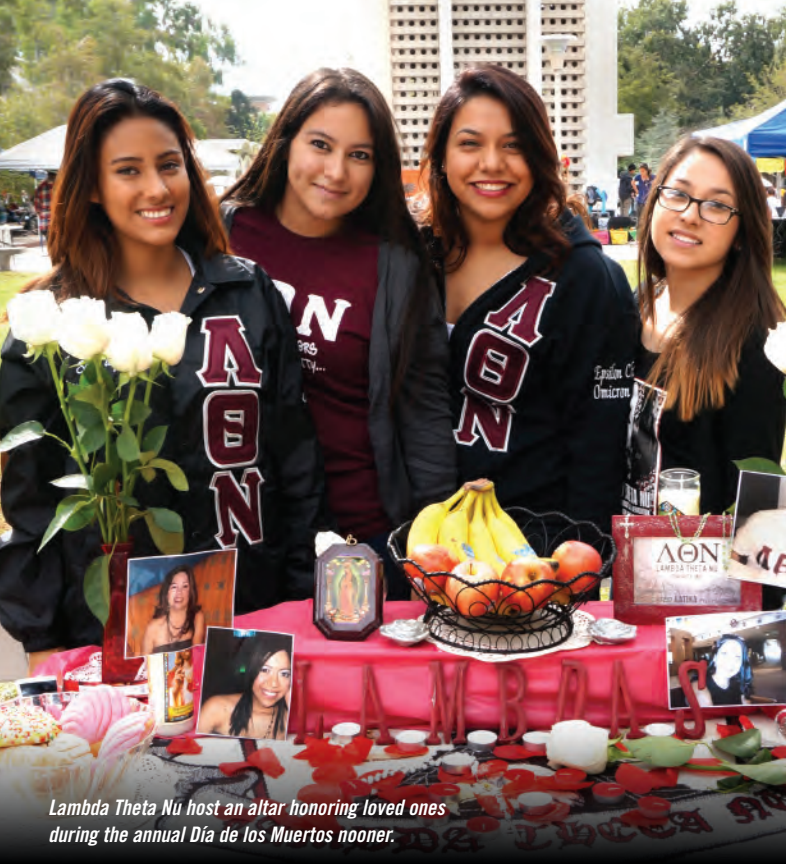
Lambda Theta Nu host an altar honoring loved ones during the annual Día de los Muertos nooner.

Packed events, big-time athletics, and crazy-fun concerts electrify student life at UCR. Learn more: rside.ucr.edu gohighlanders.ucr.edu