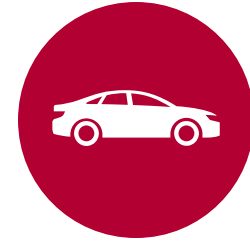
Claim-free driving rewards 2