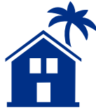
Landlord's Rental Dwelling