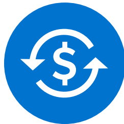
Payroll deduction 1