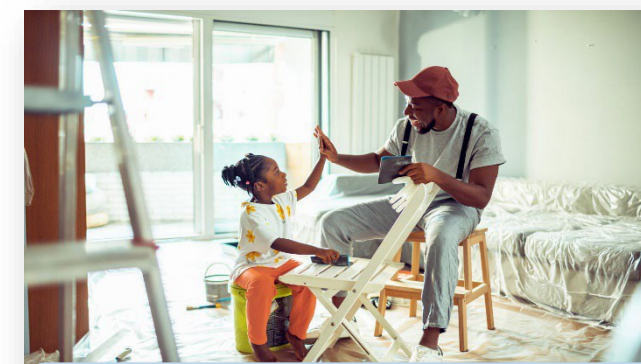
Home Equity Line of Credits