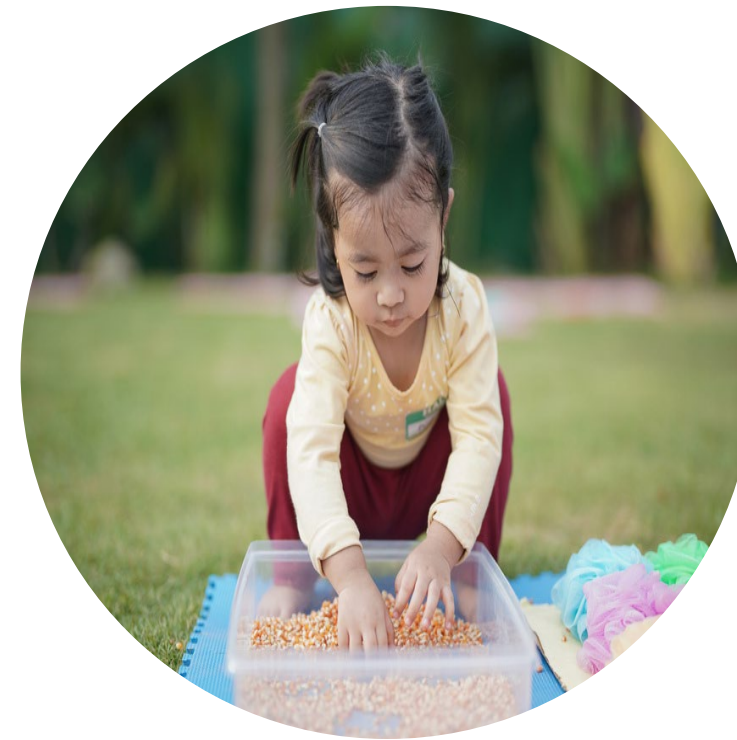
Outdoor play & exercise