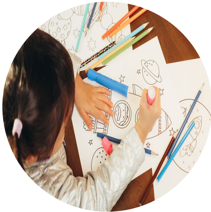
Arts & crafts